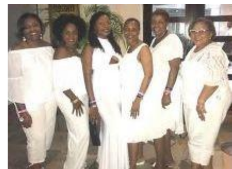
All White party