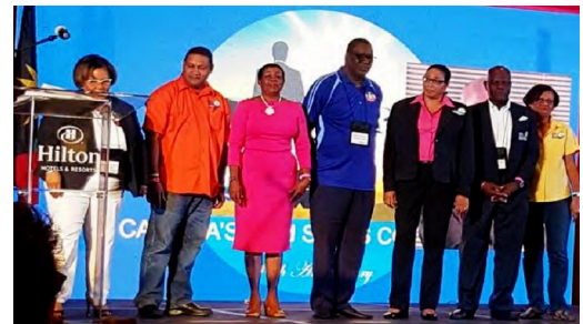
CARAIFA’s 2018-2019 Executive