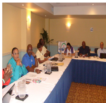
Attendees at the Annual General Meeting Hilton Rosehall Resort and Spa