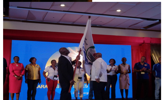
Closing and Handing over Ceremony