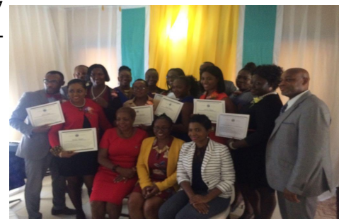
Western Chapter Inductees