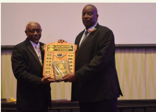
Company Award and highest percentage of agents award - Sagicor