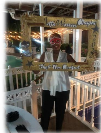
Western Chapter High Tea Cocktail