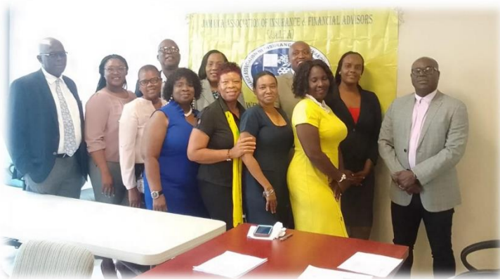
Western Chapter Managers Forum