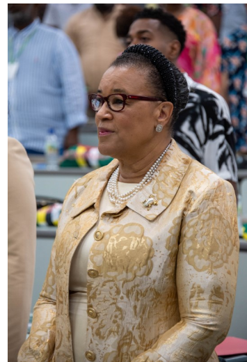
RT Hon Patricia Scotland KC, Secretary General of Commonwealth, Baroness Scotland of Asthal