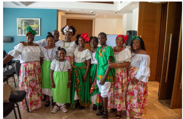
Tradibelle Cultural Group