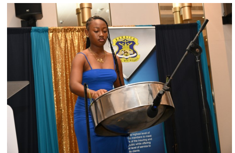
BARAIFA Awards Ceremony Entertainment