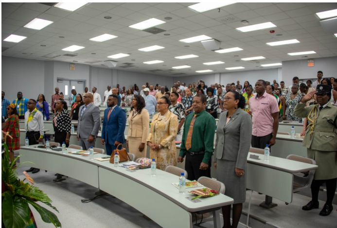
Congress 2024 Opening Ceremony