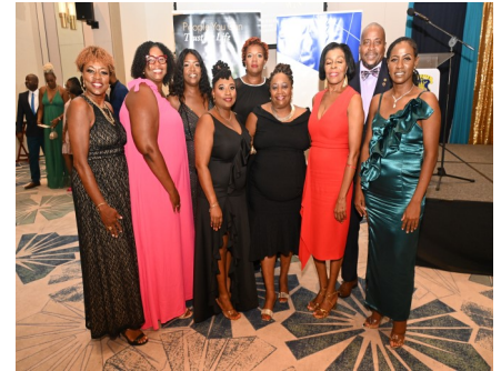
BARAIFA Incoming Board 2024-2025