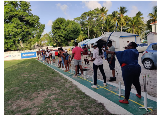
An evening of Archery held on Sunday July 2, 2023