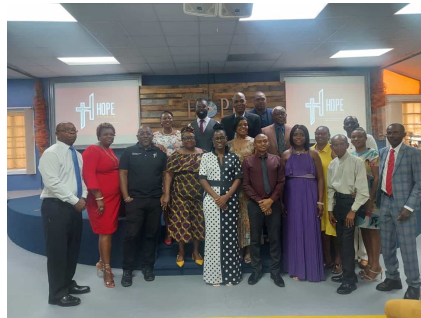
Annual Church Service June 25, 2023