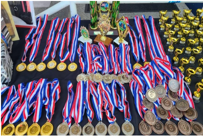
TTAIFA South Chapter hosted its first ever Cricket Tournament (TTAIFA South Chapter "Super 6" on Thursday June 8, 2023 — Competition Prizes and Medals.