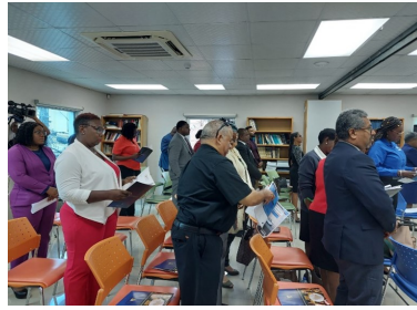
Chapter's Directors at TTAIFA Secretariat for TTAIFA 2023 AGM