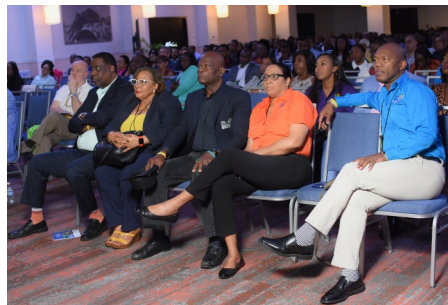
Main Room Participants — CARAIFA Executives