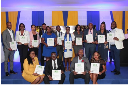
CARAIFA ACTIVITY AWARD Recipients