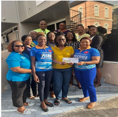
Feeding the homeless Program on June 21, 2023

BARAIFA celebrated its 50 th Anniversary on June 21 st , 2023. Several activities were held during the month to celebrate this milestone.