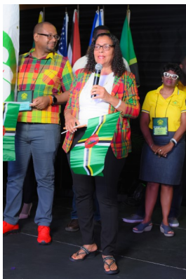
Congress 2024 Launch