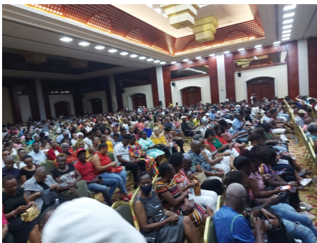
Patrons @ Western Chapter Benefit Play