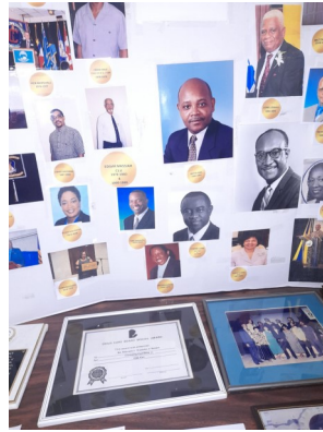
Open Day displaying Past Presidents' pictures