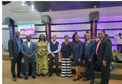
Church service at Trumpet Call Ministries on