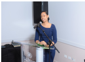
Speakers' Forum Participant