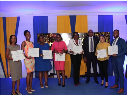
CARAIFA QUALITY AWARD Recipients