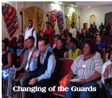
Changing of the Guards