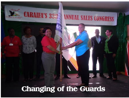
Changing of the Guards