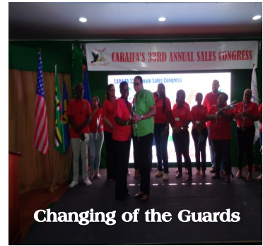
Changing of the Guards