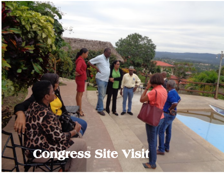
Congress Site Visit