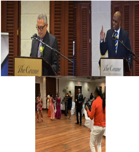
The Annual Awards at Crane Resort in Barbados. Saturday June 29 th 2019.