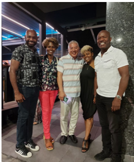
CARAIFA Executives and Consultant hosted by TTAIFA's President in Trinidad on their way back from Executive Meeting in Dominica