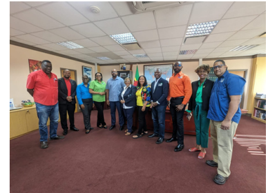
CARAIFA Executives and Congress Committee meeting with Acting Prime Minister Hon. Roland Royer; Minister for Agriculture, Fisheries, Blue and Green Economy in Dominica