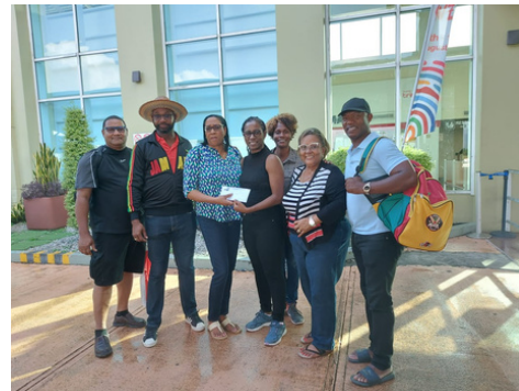
CARAIFA receives donations from Education Chair and Executives for CARAIFA Foundation

Address 72 Hope Road, Kingston 6, Jamaica