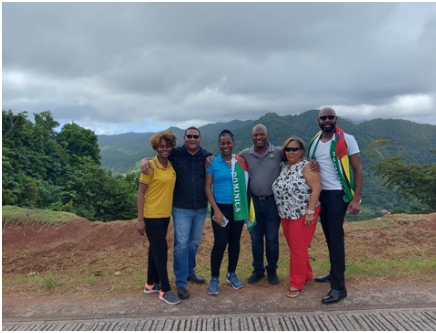
Beautiful scenery behind Executives at Congress hotel in Dominica