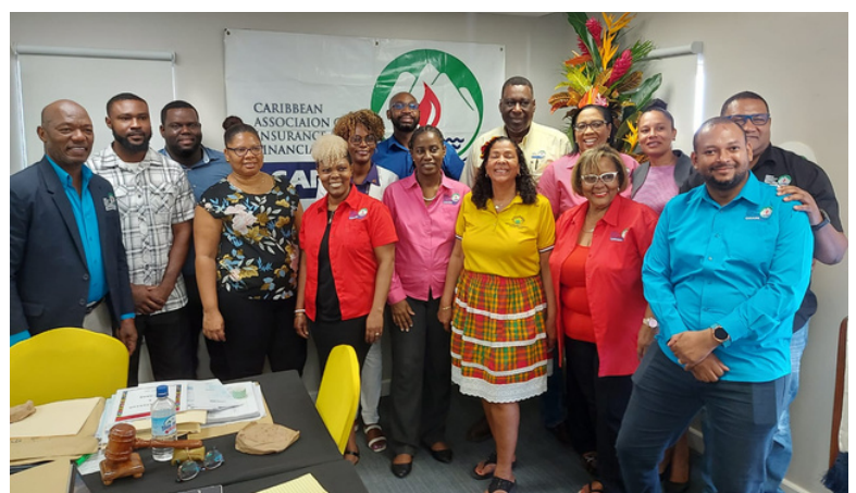
CARAIFA Executives and Congress Committee at work