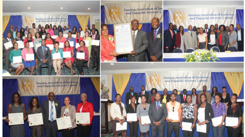
JAIFA AWARDS AND INDUCTION CEREMONY.

Members were recognized for their outstanding performances for the year 2016; one hundred & six (106) persons received the CARAIFA's Activity Awards, thirty- one (31) CARAIFA's President Awards, sixty-three (63) CARAIFA's Quality Awards, one hundred & forty-five (145) MDRT qualifiers inter-alia. Education graduates were also recognized ; five (5) FSCP .