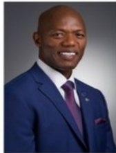
HUGH MEREDITH PUBLIC RELATIONS & COMMUNICATIONS