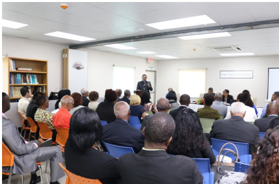
TTAIFA 's Annual General Meeting