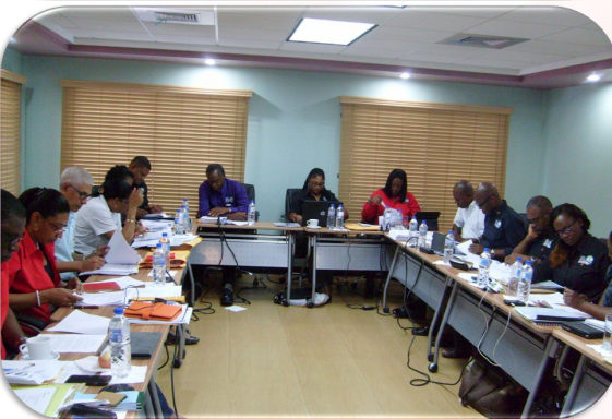
CARAIFA executives and delegates at CARAIFA's 38th Annual General Meeting for 2015