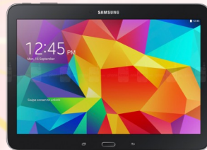
1 st PLACE WINNER - Samsung Tab 4 MIRNA PAUL-GREENIDGE BELIZE