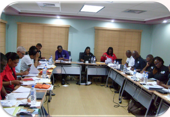
CARAIFA executives and delegates at CARAIFA's 38th Annual General Meeting for 2015