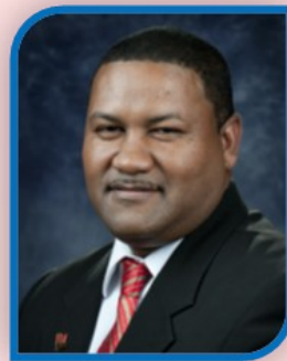
Submitted by: Gerald Cruickshank CARAIFA Foundation Chair

The Kidneys are two organs located in your abdominal cavity on either side of your spine in the middle of your back, just above the waist. They perform several life-sustaining roles: They cleanse your blood by removing waste and excess fluid, maintain the balance of salt and minerals in your blood, and help regulate blood pressure.