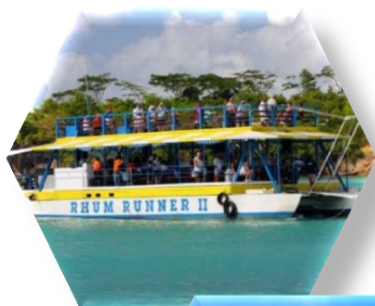
Rhum Runner Boat Cruise (Wednesday)

and be entertained while you are there ..