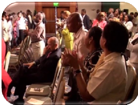
Congress attendees in Main Platform Focus at Congress 2010