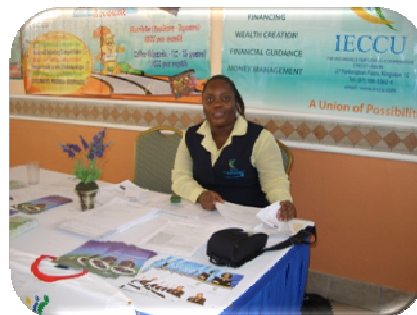
Insurance Co-op Credit Union Service on Display: at CARAIFA Congress 2010 "Shopping Mall"